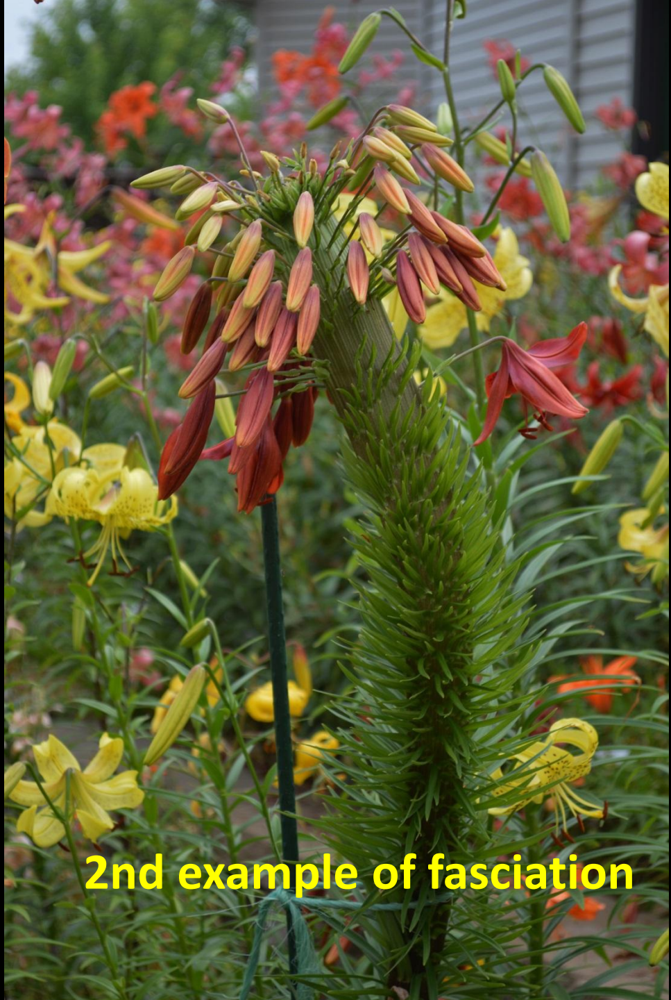
2nd example of fasciation